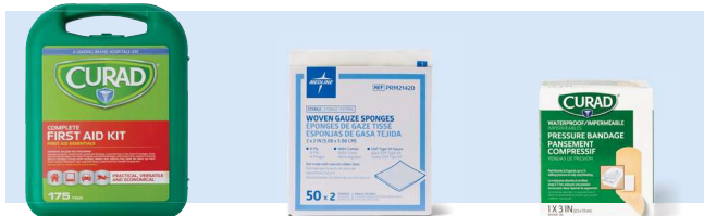
CURAD® 175-Piece Complete First Aid Kit

Treat minor injuries quickly and confidently