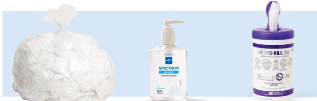
Trash Can Liners

From hand hygiene to cleaning and disinfecting